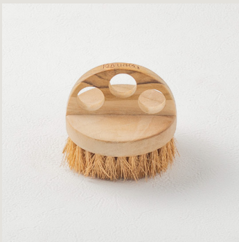
WOODEN VEGETABLE BRUSH