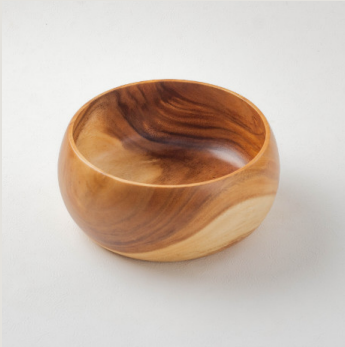
LARGE BUDDHA BOWL