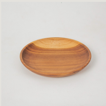
MEDIUM WOODEN PLATE SKU 5649