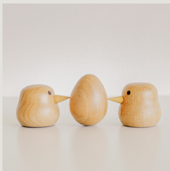
2 CHICKEN WITH EGG