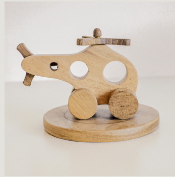
HELICOPTER WITH HELI PAD