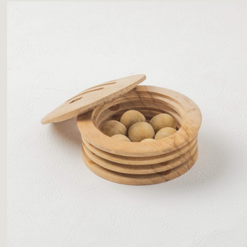
UNSCENTED WOODEN BALLS SKU 5763