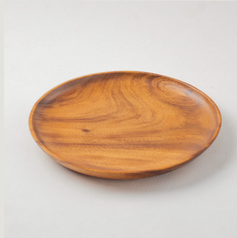
LARGE WOODEN PLATE