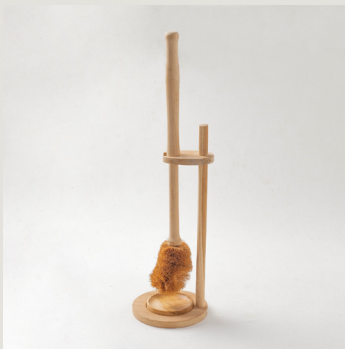
WOODEN TOILET BRUSH