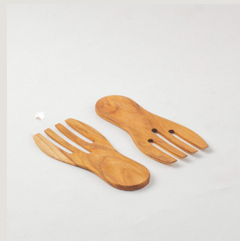
WOODEN SALAD SERVER SKU 5674