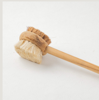
WOODEN BODY & FEET BRUSH