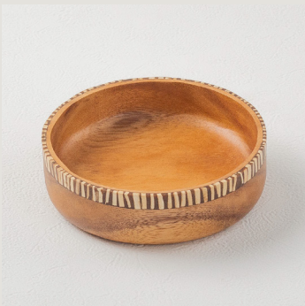
SMALL WOODEN BOWL WITH COCONUT SHELLS INLAY