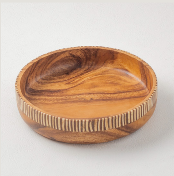
LARGE WOODEN BOWL WITH COCONUT SHELLS INLAY