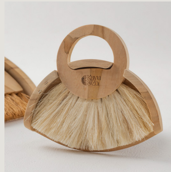
SMALL WOODEN DUSTPAN