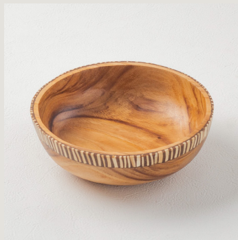
MEDIUM WOODEN BOWL WITH COCONUT SHELLS INLAY