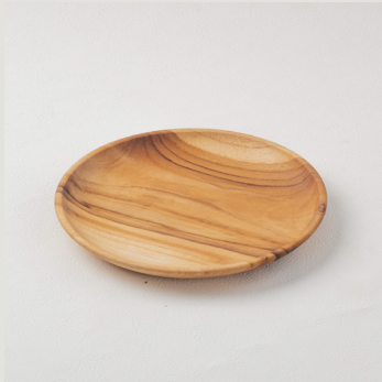
SMALL WOODEN PLATE SKU 5648