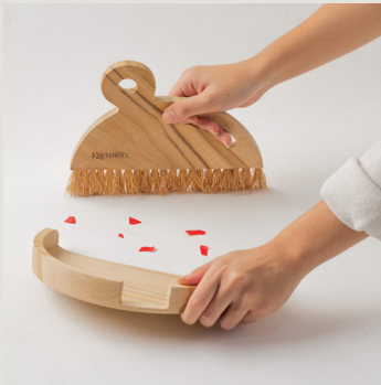
LARGE WOODEN DUSTPAN