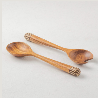
WOODEN SALAD SERVER WITH COCONUT SHELLS INLAY